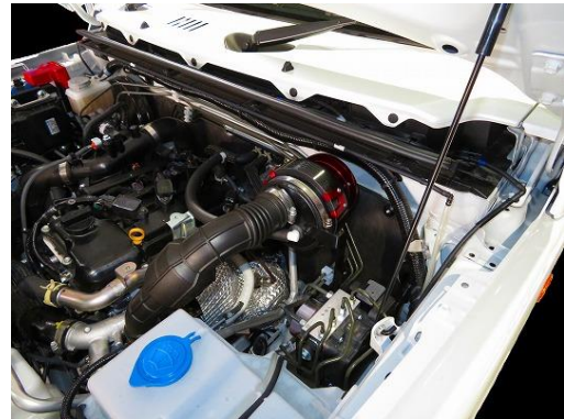
35256 : CARBON POWER AIR CLEANER