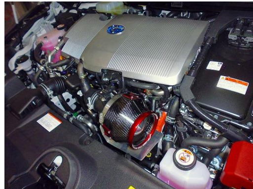
35237 : CARBON POWER AIR CLEANER