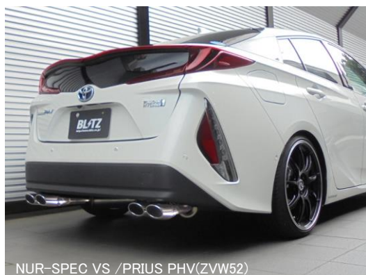
NUR-SPEC VS /PRIUS PHV(ZVW52)

Tail design finished with an elegant mirror surface