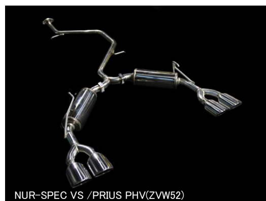
NUR-SPEC VS /PRIUS PHV(ZVW52)