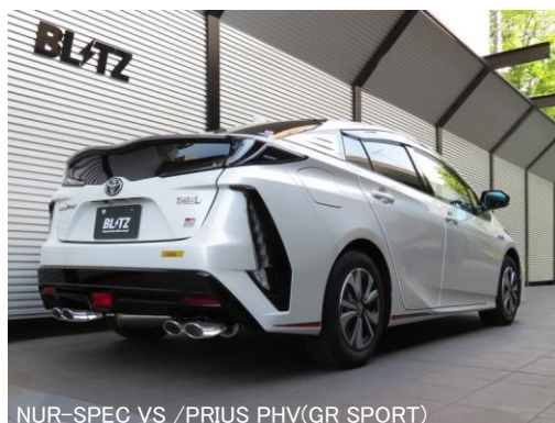
NUR-SPEC VS /PRIUS PHV(GR SPORT)