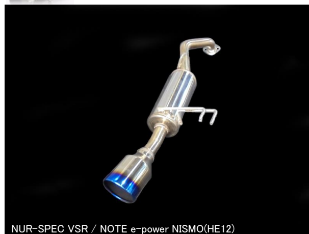
NUR-SPEC VSR / NOTE e-power NISMO(HE12)

Tail design finished with an elegant mirror surface