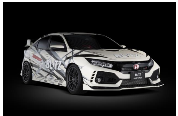
HONDA CIVIC TYPE R