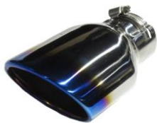
NUR-SPEC CE VSR Tail

Optional tail pipe can be purchase separately.