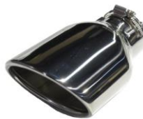
NUR-SPEC CE VS Tail