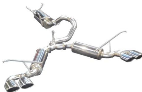
NUR-SPEC CE VS QUAD/ HIACE