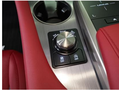
LEXUS RX300 IDLING STOP