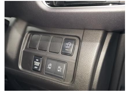
NISSAN SERENA IDLING STOP