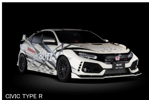
CIVIC TYPE R