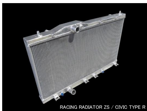
RACING RADIATOR ZS / CIVIC TYPE R