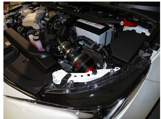
35242: CARBON POWER AIR CLEANER