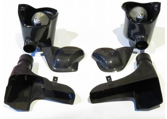
27025_CARBON INTAKE SYSTEM R35 GT-R