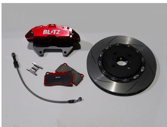
86109 ND5RC ROADSTER FRONT SET