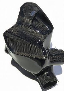
27026_CARBON INTAKE SYSTEM DB42 SUPRA