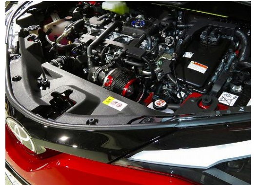
35237: CARBON POWER AIR CLEANER