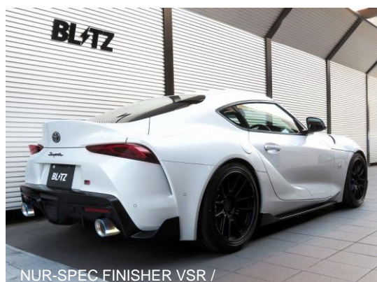
NUR-SPEC FINISHER VSR /