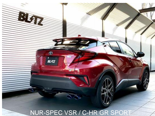
NUR-SPEC VSR / C-HR GR SPORT