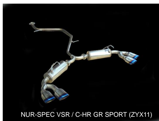
NUR-SPEC VSR / C-HR GR SPORT (ZYX11)