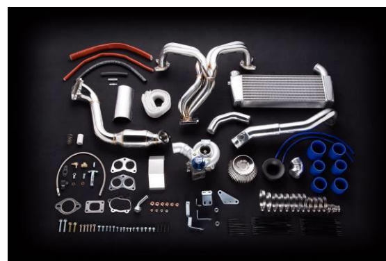
Product Composition (TUNERS KIT)