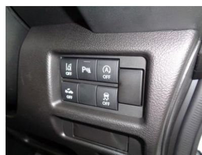
SUZUKI HUSTLER IDLING STOP