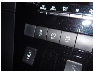
TOYOTA GRANACE IDLING STOP