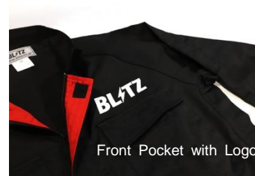
Front Pocket with Logo