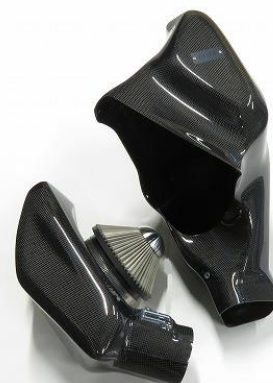
27027 CARBON INTAKE SYSTEM DB82 SUPRA