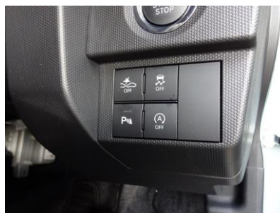
DAIHATSU TAFT IDLING STOP