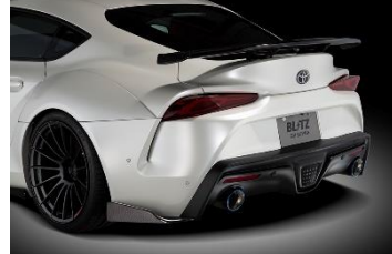
Rear Bumper (FRP) & Rear Bumper Side Fin Carbon