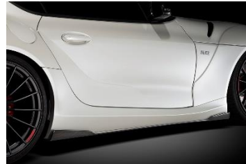
Side Spoiler (FRP) & Side Diffuser Carbon