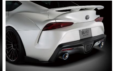
Rear Bumper (FRP) & Rear Bumper Side Fin