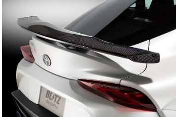
Rear Wing Carbon