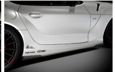
Side Spoiler (FRP) & Side Diffuser