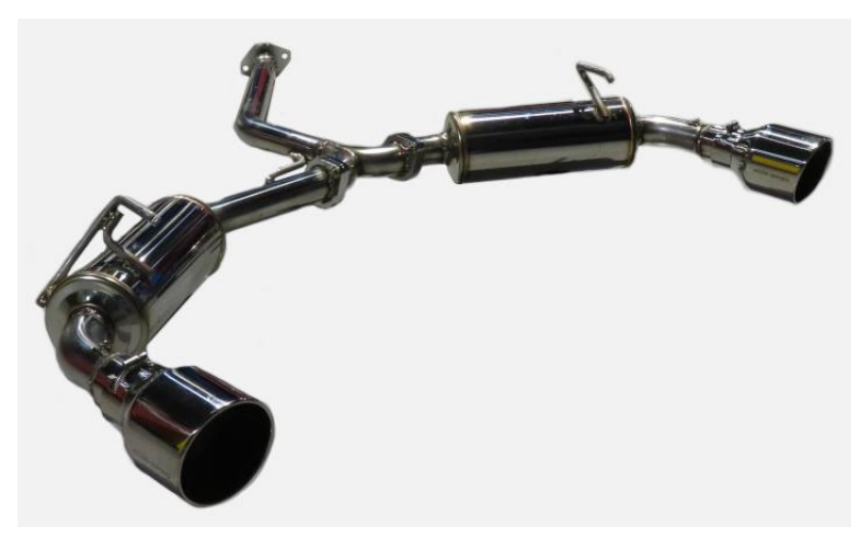
NUR-SPEC CE VS / HARRIER HYBRID