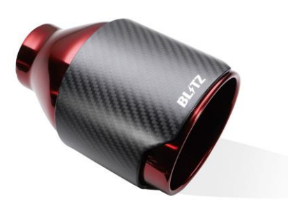
NUR-SPEC CE CR Tail

※1: Measurement taken at location of shortest road clearance Data has been acquired when the vehicle rested at stock height. Measurement will vary between vehicles.