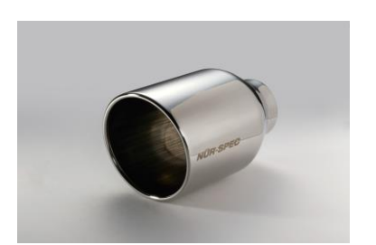
NUR-SPEC CE VS Tail