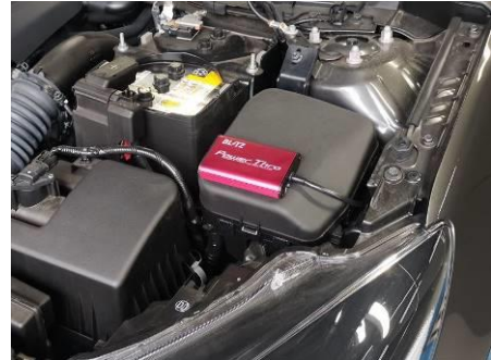
MAZDA2 Installation Example