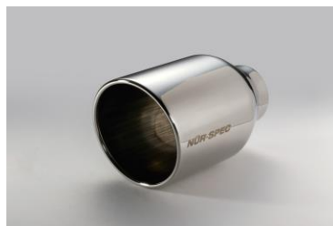
NUR-SPEC CE VS tail