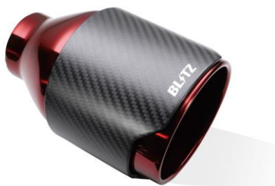
NUR-SPEC CE CR tail

※1: Measurement taken at location of shortest road clearance Data has been acquired when the vehicle rested at stock height. Measurement will vary between vehicles.