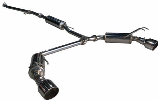
NUR-SPEC CE VS / CR-V