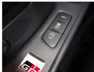
TOYOTA GR YARIS IDLING STOP