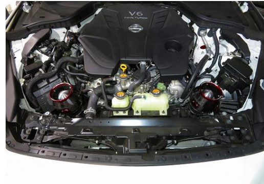
35265 : CARBON POWER AIR CLEANER