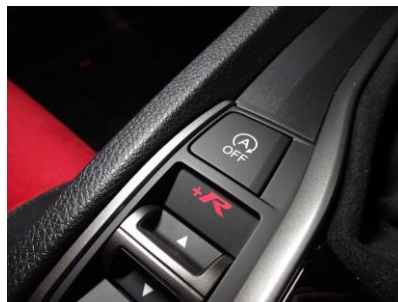
Honda Civic Type R Idling Stop