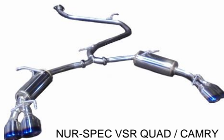
NUR-SPEC VSR QUAD / CAMRY