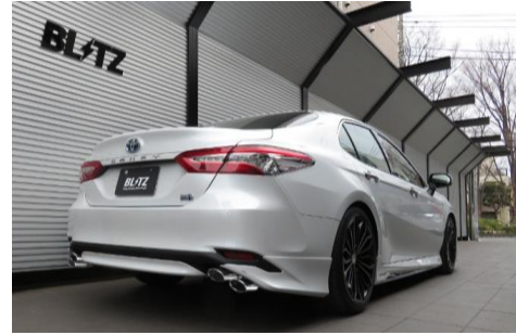
NUR-SPEC VS QUAD / CAMRY (TRD Garnish)

Tail design finished with an elegant mirror