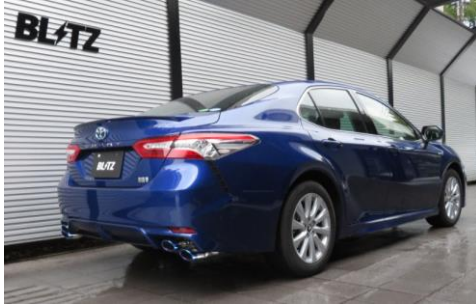
NUR-SPEC VSR QUAD / CAMRY

Race inspired Titanium colored tail design