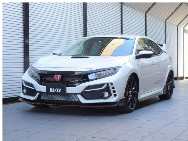
HONDA CIVIC TYPE R FK8