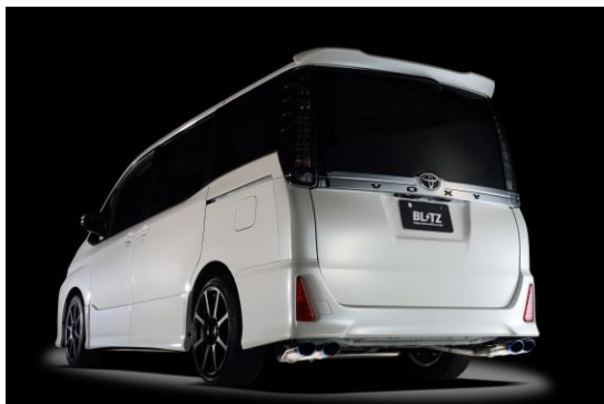
NUR-SPEC VSR QUAD / VOXY

Tail design finished with an elegant mirror