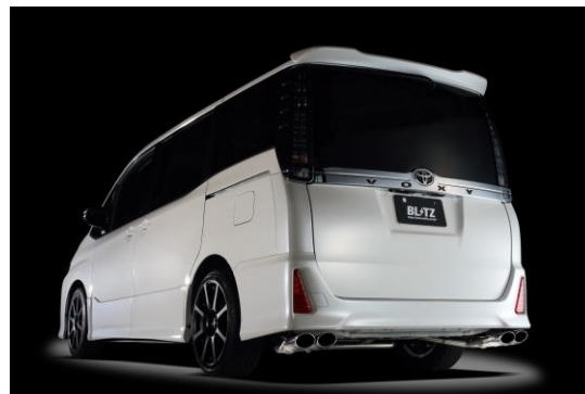
NUR-SPEC VS QUAD / VOXY