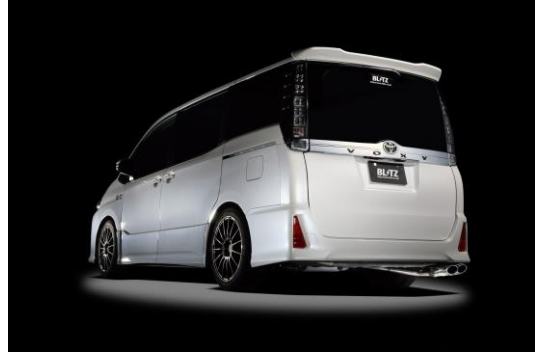
NUR-SPEC VS QUAD / VOXY

Tail design finished with an elegant mirror