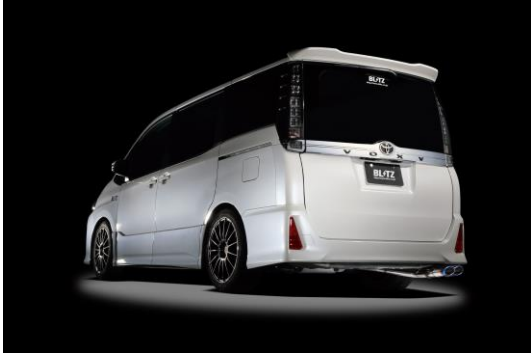
NUR-SPEC VSR QUAD / VOXY

Race inspired Titanium colored tail design