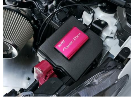
TOYOTA GR YARIS