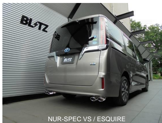
NUR-SPEC VS / ESQUIRE

Tail design finished with an elegant mirror