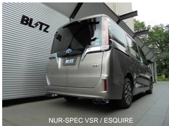
NUR-SPEC VSR / ESQUIRE

Race inspired Titanium colored tail design