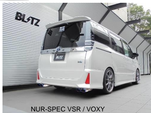
NUR-SPEC VSR / VOXY

Tail design finished with an elegant mirror