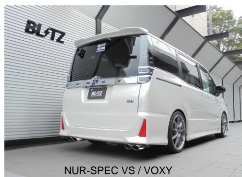
NUR-SPEC VS / VOXY