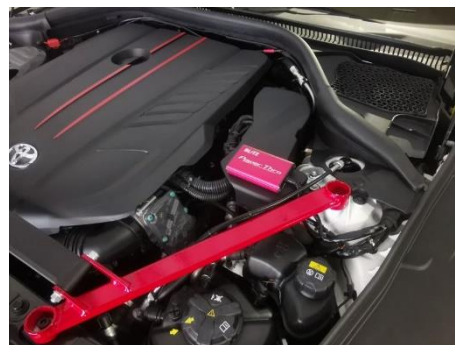
TOYOTA SUPRA RZ Installation Example