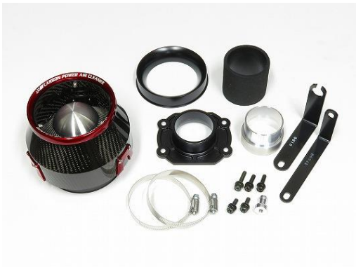
SUZUKI JIMNY SIERRA JB74W CARBON POWER