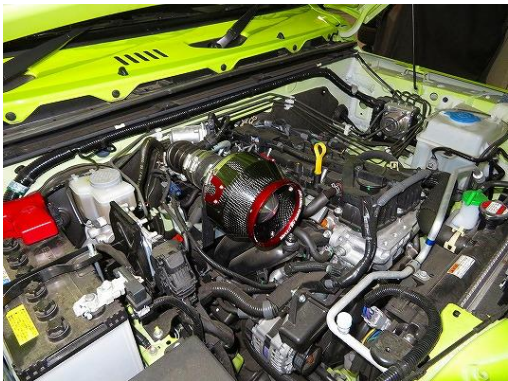
SUZUKI JIMNY SIERRA