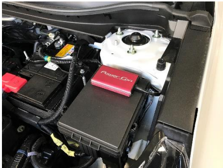
Installation on HONDA CR-V