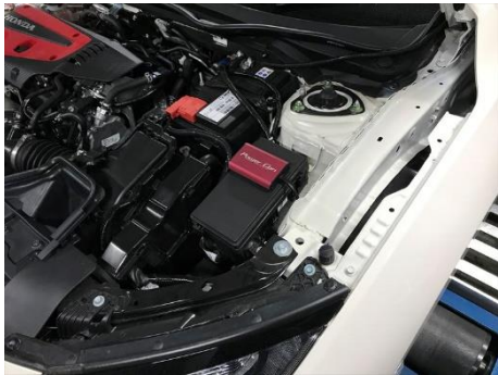
Installation on HONDA CIVIC TYPE R