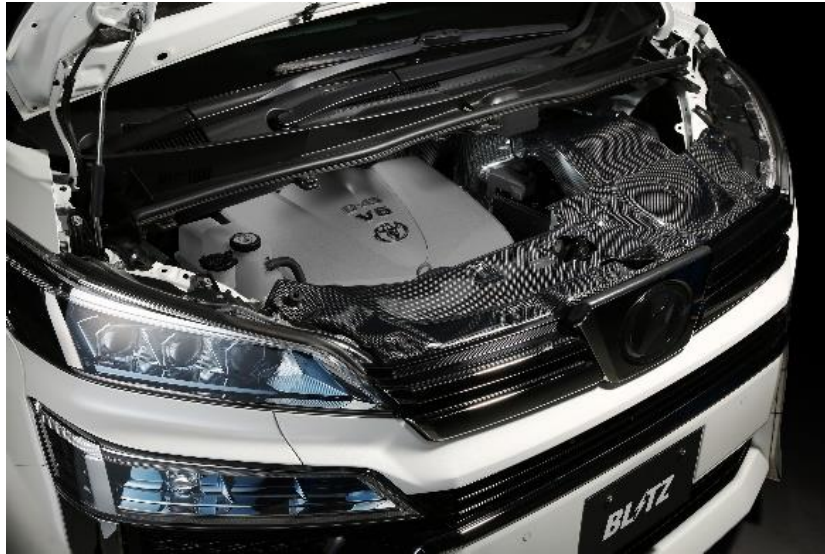
TOYOTA VELLFIRE 3.5L

Click here for further information on CARBON INTAKE SYSTEM