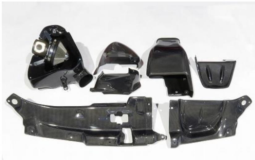
Code No : 27028 CARBON INTAKE SYSTEM