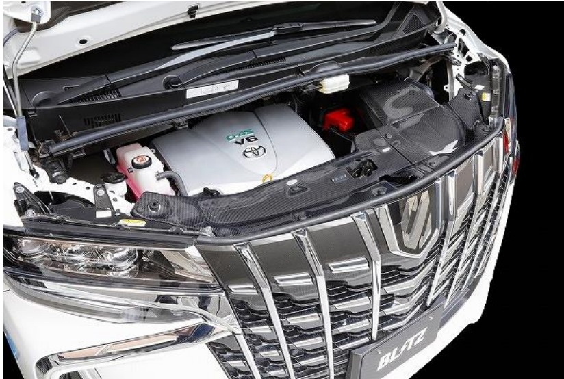
TOYOTA Alphard 3.5L

Click here for further information on CARBON INTAKE SYSTEM