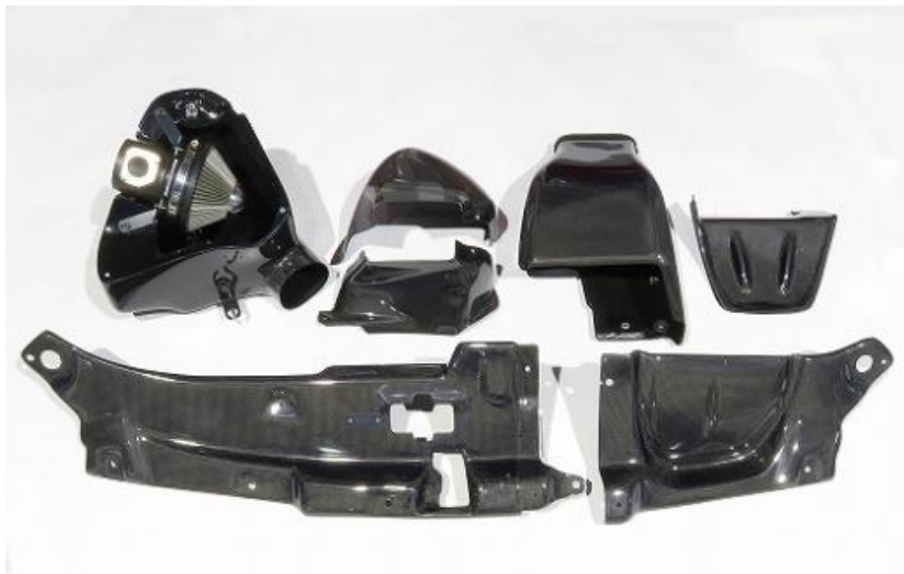
Code No : 27029 CARBON INTAKE SYSTEM