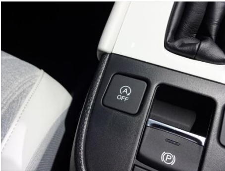
HONDA FIT Idling Stop