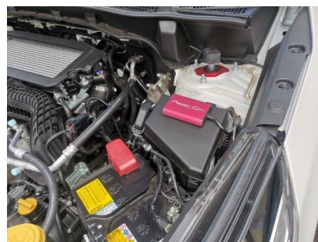
SUBARU Forester Installation Example