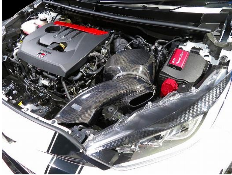
TOYOTA GR Yaris (GXPA16)

Click here for further information on CARBON INTAKE SYSTEM