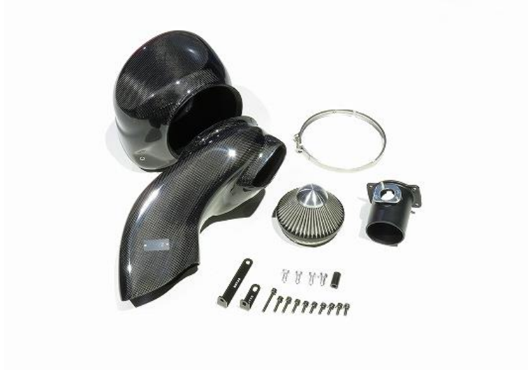
Code No : 27030 CARBON INTAKE SYSTEM GR Yaris