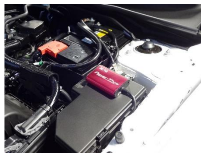
HONDA Civic Installation Example