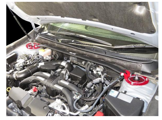
Subaru Legacy Outback Front Installation Example