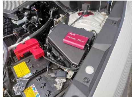
SUBARU Legacy Outback