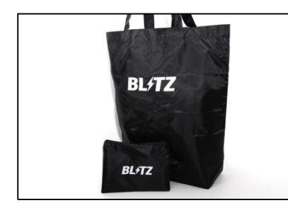
Bag and pouch printed with BLITZ logo.