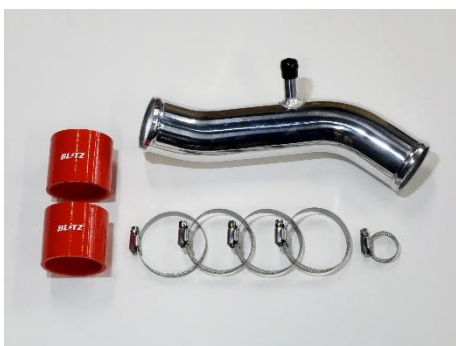
SUCTION KIT RED