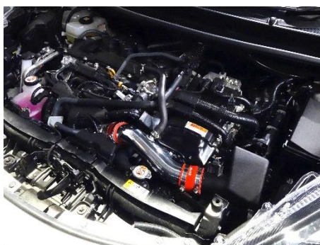
SUCTION KIT RED