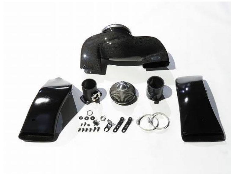
27031 CARBON INTAKE SYSTEM